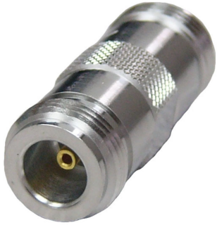
Type N Female to Type N Female Adapter