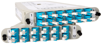
FPX Fiber Optic MPO Module, Multimode Ultra 50/125 (OM3), 12 fiber SC adapter, left, putty white