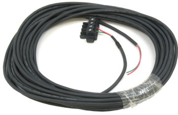
Alarm Cable Assembly for Low Loss Combiners, 8 m