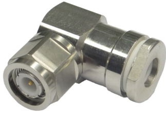
TNC Male Right Angle for CNT-300 braided cable