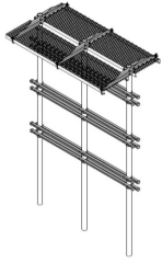
H-Frame with Ice Canopy, 8ft long with 3 Posts