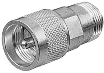
Type N Female to UHF Male Adapter