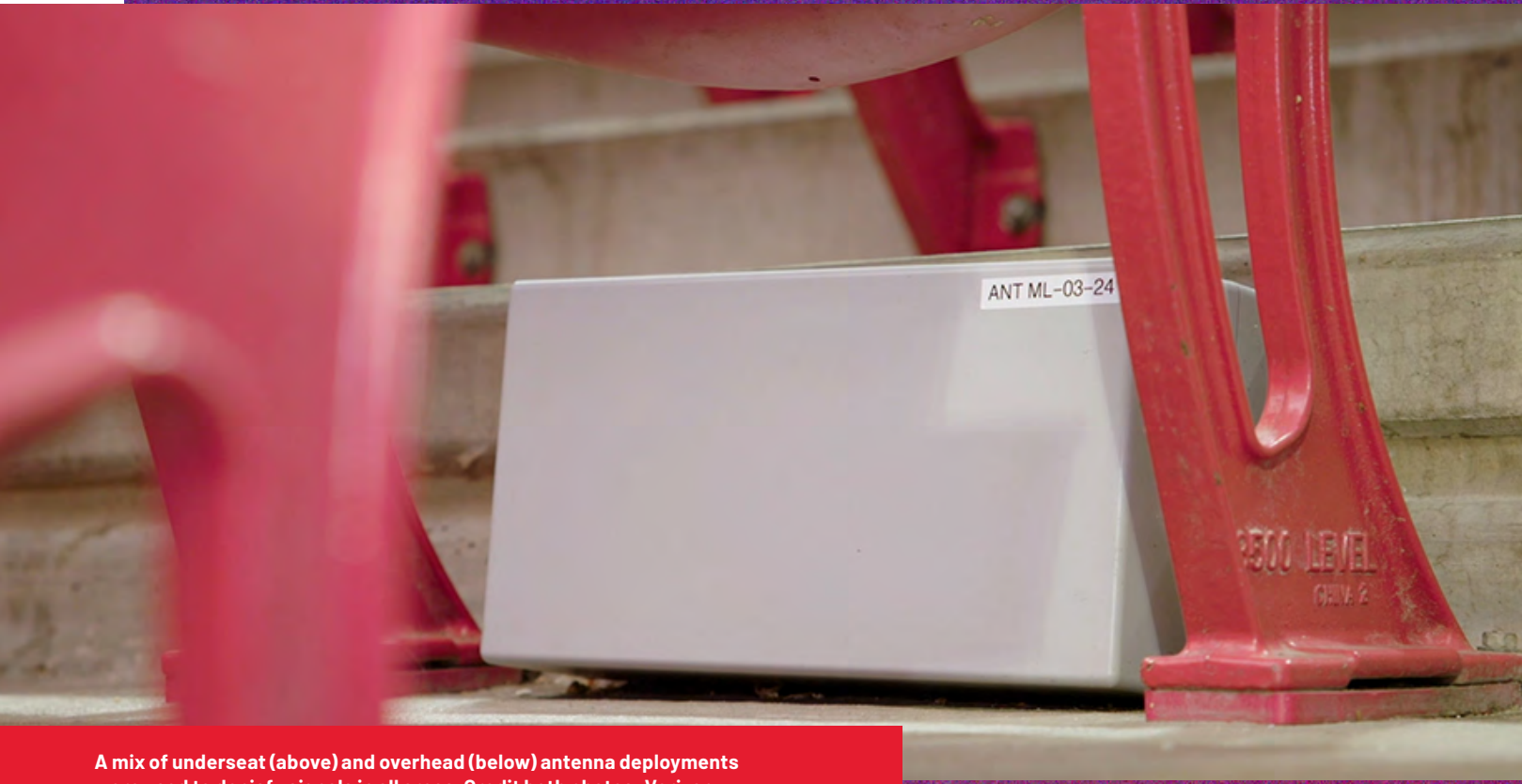
A mix of underseat (above) and overhead (below) antenna deployments were used to densify signals in all areas.