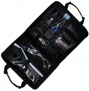
LightCrimp Plus™ Fiber Optic Termination Tool Kit, LC/SC, with microscope