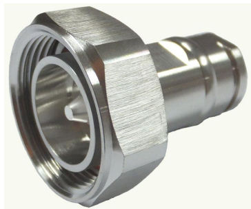
7-16 DIN Male for CNT-400 braided cable