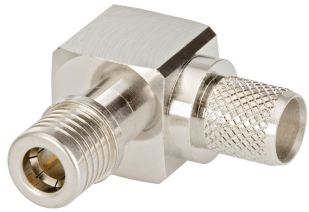
QMA Male Right Angle for CNT-400 braided cable