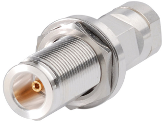
Type N Female Bulkhead for 1/4 in LDF1-50 cable