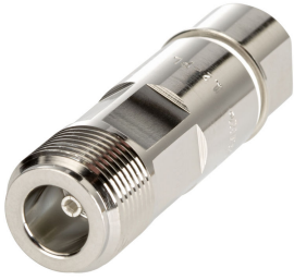
Type N Female Positive Lock for 3/8 in LDF2-50 cable