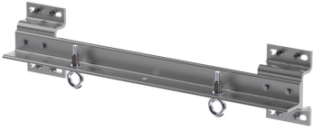
Cable Support Mount for Guyed Towers to Support Cable, 36" Face

-The "860674607-036 is a purpose built tower face bracket that is designed to support 1000 pounds of cable per eye up to 2000 pounds in combination. Ideal for Hybrid cable. Includes mounting eye bolt for attachment.