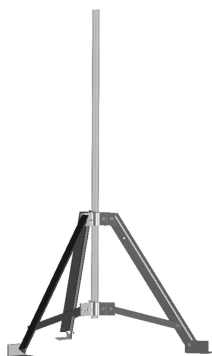
Universal Tripod Mount, 4-1/2 in OD x 96 in pipe