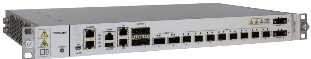
CommScope PON Evo 800 Series OLT

Type B protection is available for the subscriber side, while for the network side, star and ring topologies are available with multiple 1/10GE and/or 100GE optical interfaces. These interfaces are supported by the Link Aggregation Control Protocol (LAG/LACP) and the Ethernet Ring Protection Switching (ERPS ITU-T G.8032) protocol.