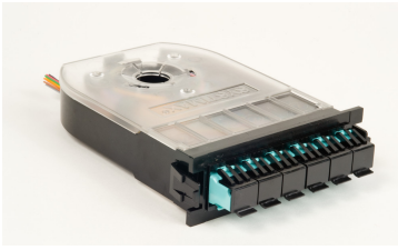
G2 Modular Cassette with 12 LC LazrSPEED® 550 Pigtails