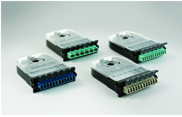
G2 Modular Cassette with 12 LC TeraSPEED® Singlemode Pigtails