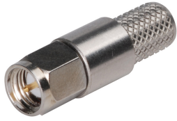
SMA Male for CNT-300 braided cable