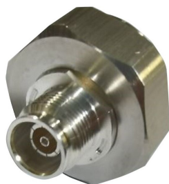
2.2-5 Female to 7-16 DIN Male Low-PIM Adapter