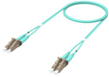
Fiber Optic Patch Cord, Duplex, Multimode, LC/UPC to LC/UPC, 35 m