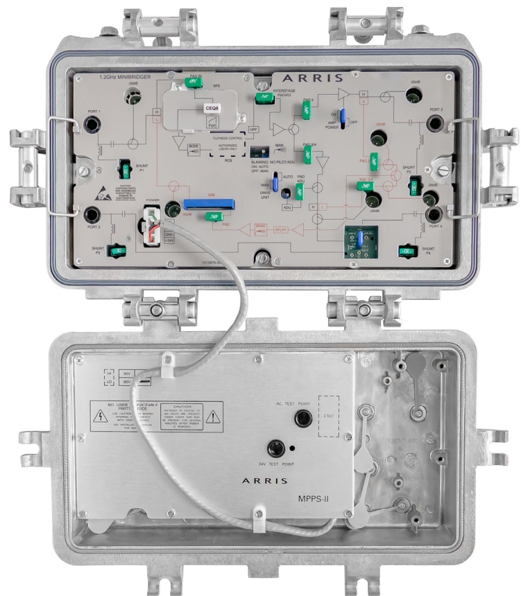
MB120 with 27 dB Return Gain Shown

The new CommScope 1.2 GHz MB120 MiniBridger Amplifier enables cable operators to take advantage of DOCSIS 3.1 efficiencies while maintaining backward compatibility of existing 750 MHz, 870 MHz, and 1 GHz systems.