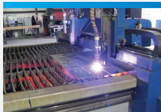
High-definition plasma cutting station