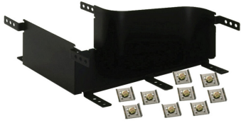
FiberGuide® Left Reducer, 4x24 to 4x12in, Black