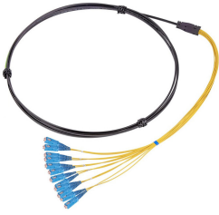
Fiber Optic Cable Assembly, 12 SC/UPC to Stub, 12-fiber, 1700 Feet